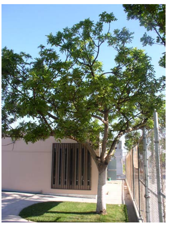
Green Meadows Recreation Center 431 E. 89th St Los Angeles, CA 90003