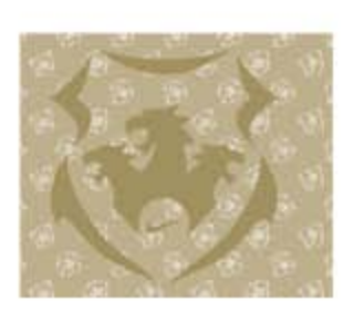
LAFAYETTE PARK Futsal Fields Summer 2006

Nike greatly appreciates its partnership with the City of Los Angeles and the Amateur Athletic Foundation of Los Angeles. Together we are able to provide these world-class fields to the youth of LA as part of the NikeGO Places program, so that the benefits of sport and physical activity may be enjoyed.