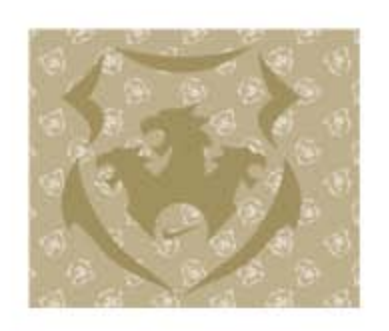
GLASSELL PARK Futsal Field Summer 2006

Nike greatly appreciates its partnership with the City of Los Angeles and the Amateur Athletic Foundation of Los Angeles. Together we are able to provide this world-class field to the youth of LA as part of the NikeGO Places program, so that the benefits of sport and physical activity may be enjoyed.