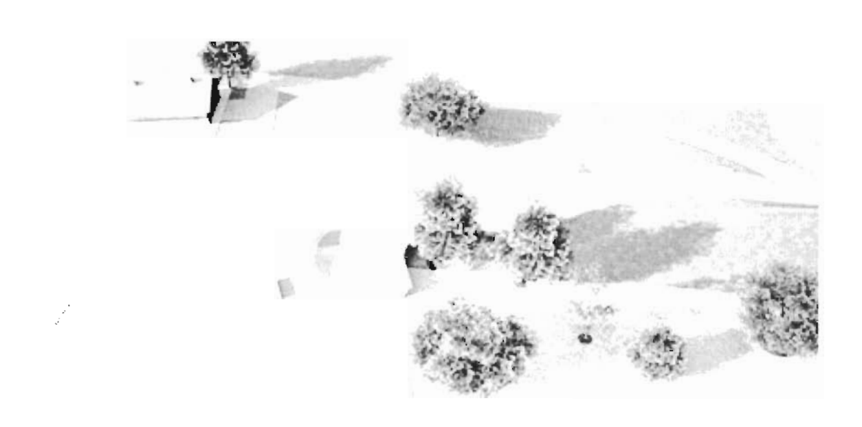
EXHIBIT-A <u>Skate Plaza Renderings</u>