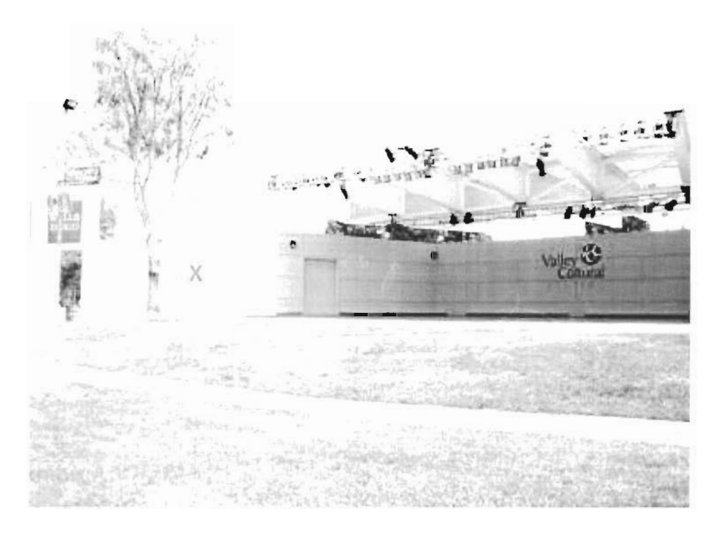
Proposed Mural Location