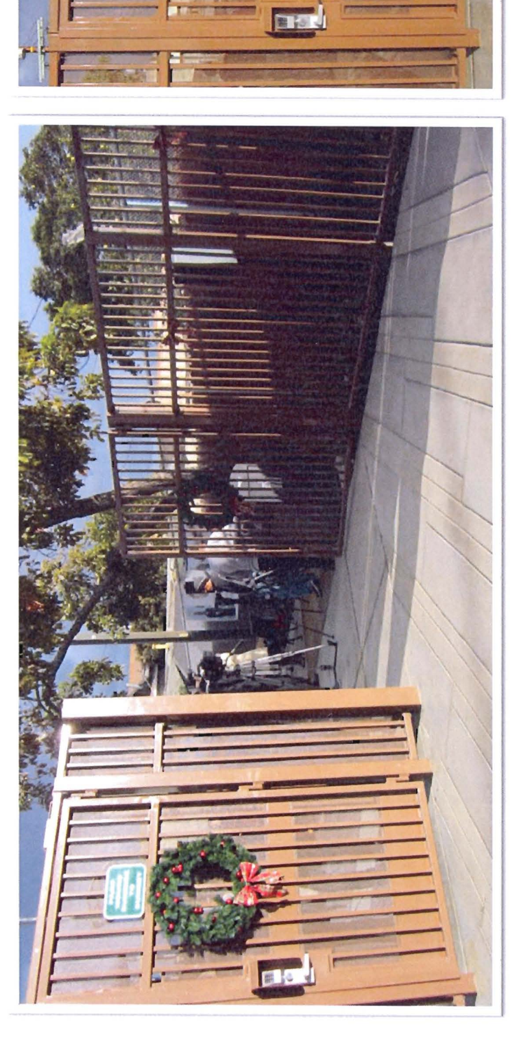
Tubular Steel Fencing and Pedestrian Gates