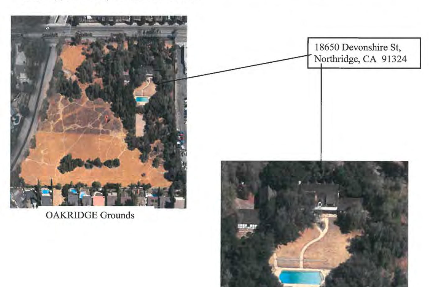
OAKRIDGE Residential Structure and surrounding grounds.

Delineated below, the Oakridge Residence is located at 18650 Devonshire Street, Northridge, CA 91324, and includes a two-story Tudor home, pool, and tennis courts within approximately 9.47 acres of land.