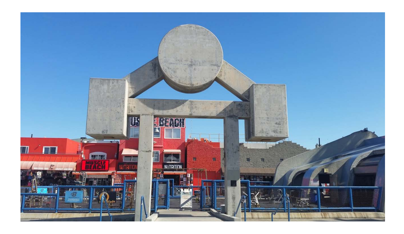
Photo of MBV STRUCTURE owned by the City of Los Angeles, and located within the grounds of Venice Beach Recreation Center and Muscle Beach Venice