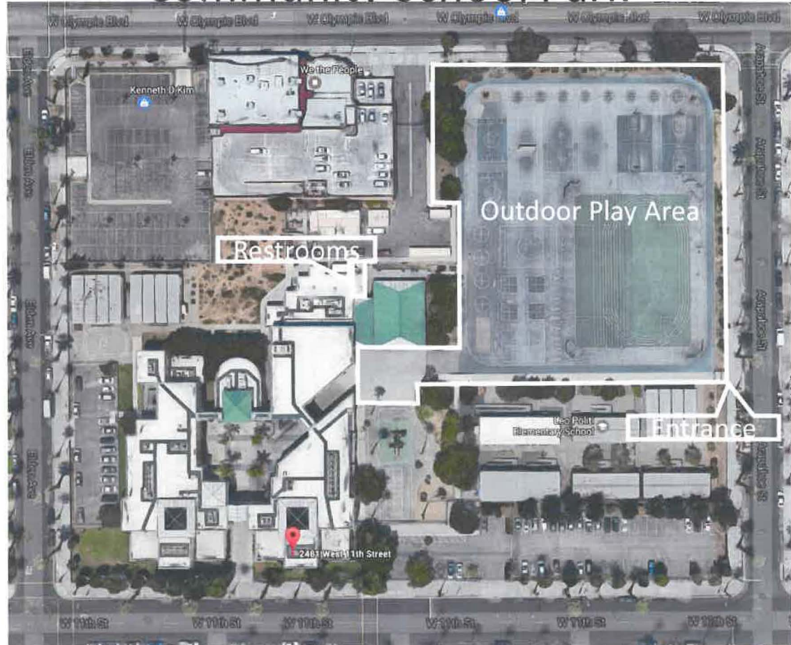
EXHIBIT A-4 Leo Politi Elementary School Community School Park