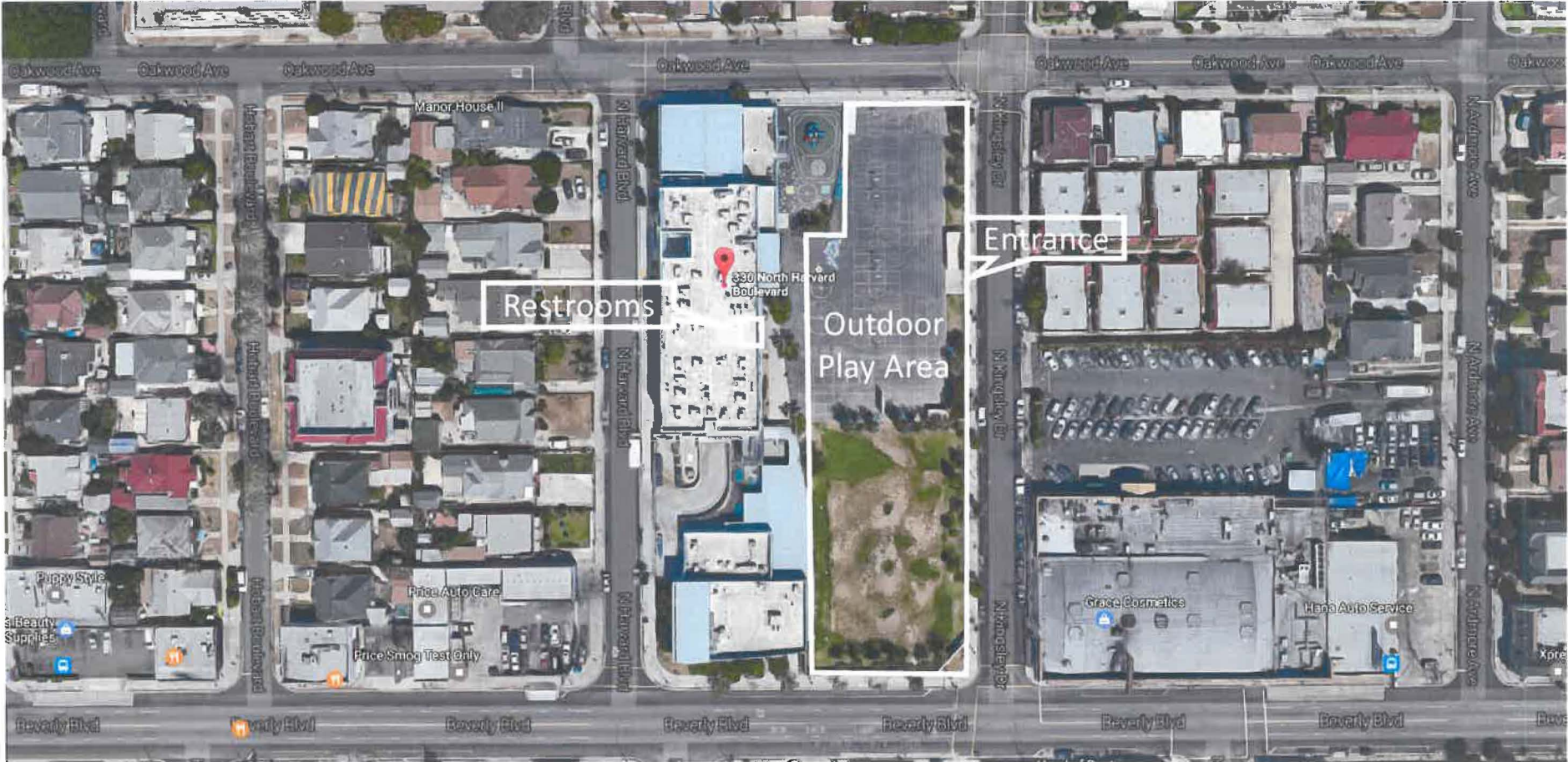
EXHIBIT A-2 Harvard Elementary School Community School Park