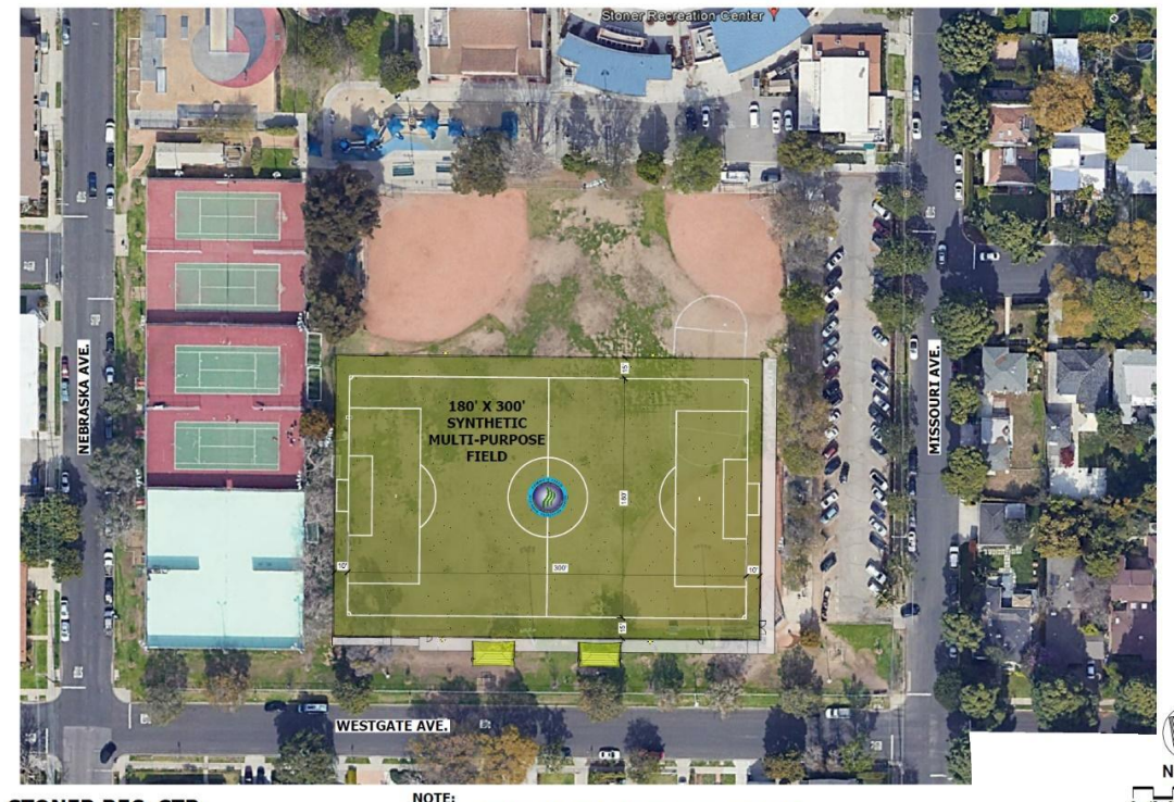
STONER REC. CTR.