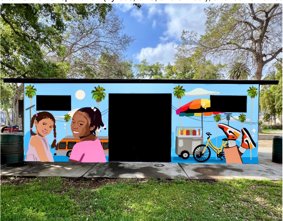
Side 2 (Side Wall Daylight) shows the local fruit trees: lemons and oranges. Sides 1 and 2 are daylight shots. See rendering of side 2 below.

Side 1 (54<sup>th</sup> Street Wall) shows iconic palm trees, Latino/a and African American children, alternative transportation (by bus, bike, and on foot), and iconic fruit carts. See rendering below.