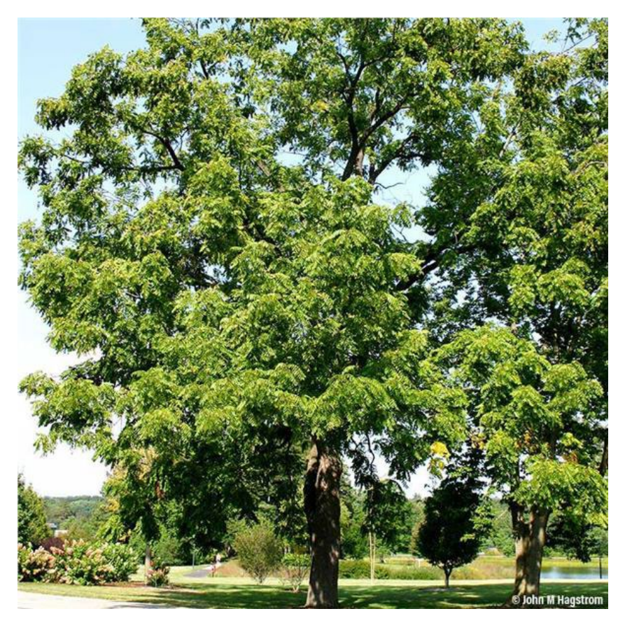
California Black Walnut Tree